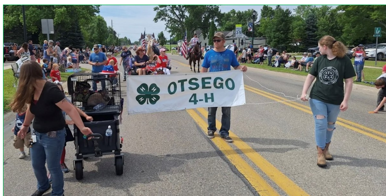
People show support for 4-H by marching in the Johannesburg 4th of July parade.