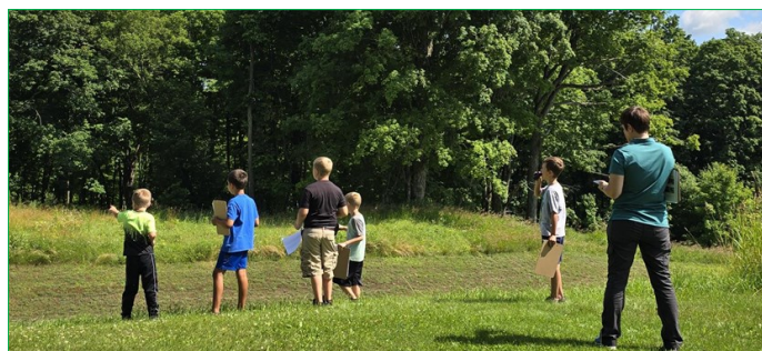
Birding is offered during 4-H Natural Days in partnership with Louis M. Groen Nature Preserve.