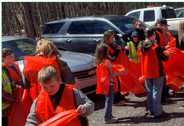
4-H Clean-up at Parmater Road