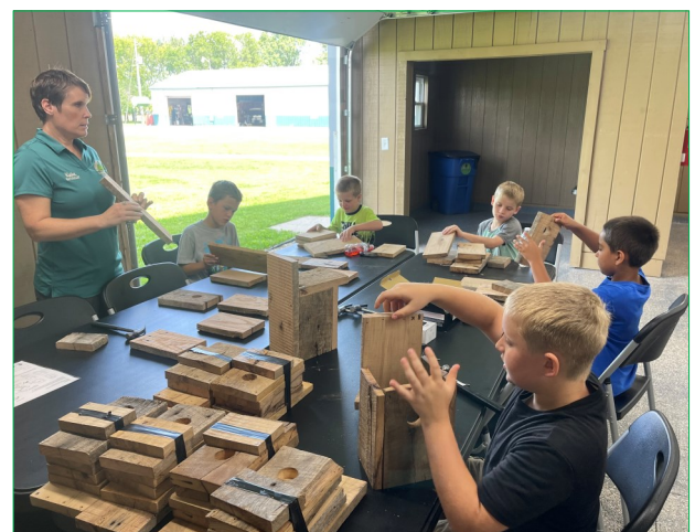
Building birdhouses — our youth participate in a variety of programming .