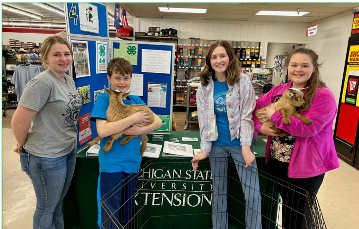
Youth are pictured during the Clover Days fundraiser for educational scholarships in partnership with Tractor Supply, Co.