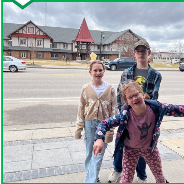
Otsego County Spring Break Scavenger Hunt winners!

The largest youth development organization in Michigan, 4-H provides thousands of young people with experiential learning opportunities to explore new interests and discover their passion.