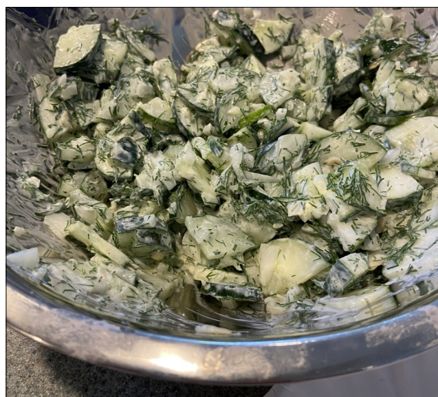
Cucumber salad made by veterans.