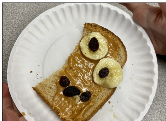
Students enjoyed making faces out of bread, fruit and soy nut butter.

“After trying new foods in school, she is more open to trying new foods at home...She likes eating broccoli and cauliflower now!”