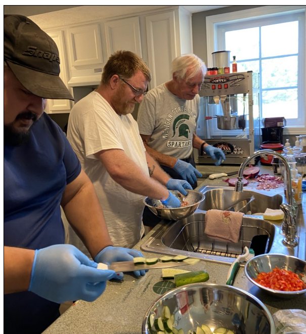
Veterans participating in Cooking for One.

In the spring of 2024, CNI Jane worked with Patriot Place staff to apply for a $1,500 SNAP-Ed policy, systems and environmental (PSE) change mini grant. Items purchased included new pots and pans, mixing bowls and utensils for each of the veteran houses, and an Instant Pot and electric wok. With these new kitchen materials, the veterans will be able to cook more meals from scratch. By cooking meals at home, the veterans will have improved diet quality leading to positive health outcomes.