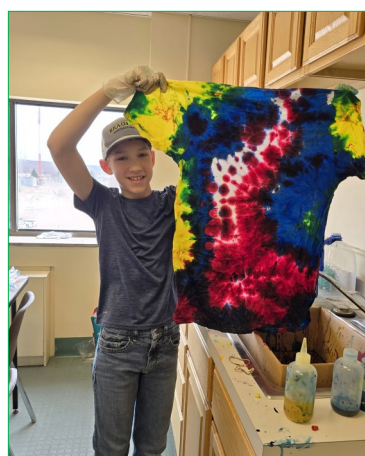
Youth at the Spring Break Extravaganza baking and tie-dyeing T-Shirts.