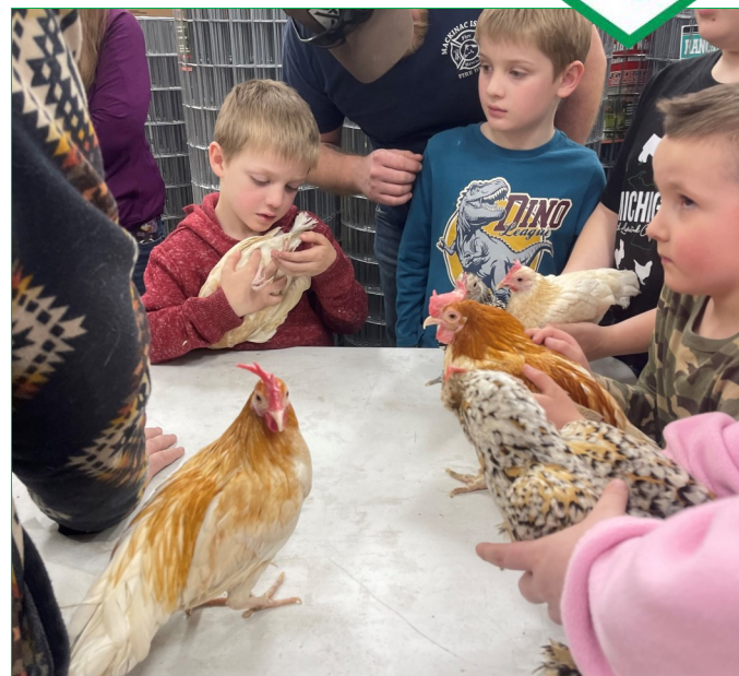
Small Animal Clinic in partnership with Family Farm and Home.