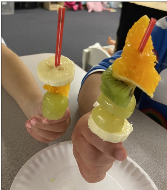
Kindergartners having fun making fruit kebabs!

Start Simple with MyPlate: helps people make healthy eating choices that are simple, like eat more whole grains, vary your protein, eat more fruits and vegetables and limit added sugars, saturated fat and sodium.